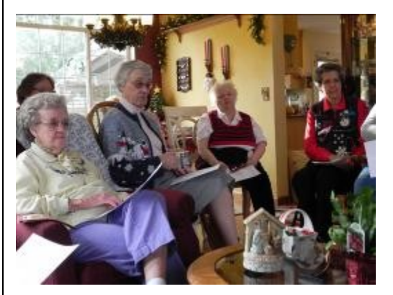
Reflecting on the Bible study verses